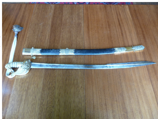
Presentation sword 1828 from the Duke of Clarence