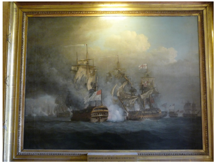
HMS Bellerophon passing through the French line, May 29th 1794

Earl Howe having made the signal for the British ships to pass through the enemy's line, the Bellerophon immediately obeyed, and passed through in close action accompanied by the Royal Charlotte and the Leviathan .