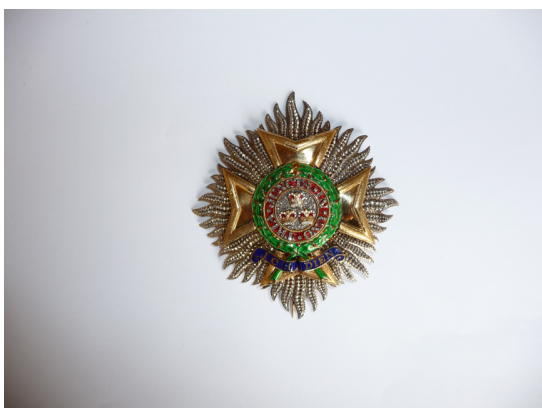
Insignia of Knight Grand Cross of the Bath

Sir William was knighted in 1815 as Knight Commander of the Order of the Bath, appointed rear admiral and vice admiral of the Red by 1819 and advanced to Knight Grand Cross of the Bath. In 1820 he became a Lord of the Admiralty.