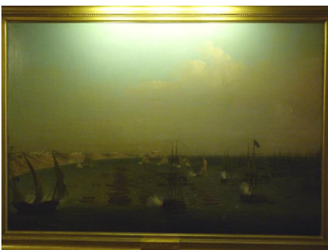
The Landing of the Army at Aboukir Bay